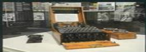
BREAKING THE CODES