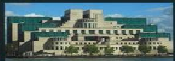
21ST CENTURY INTELLIGENCE