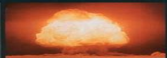
SCIENCE, THREATS & TRAITORS