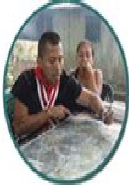
Inga Upper Caquetá, Andes Amazon