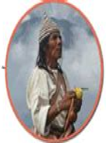
Mursi Sierra Nevada de Santa Marta