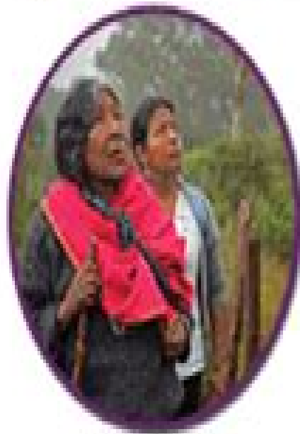
Inga - Kamëntché Inner Putumayo, Andes Amazon