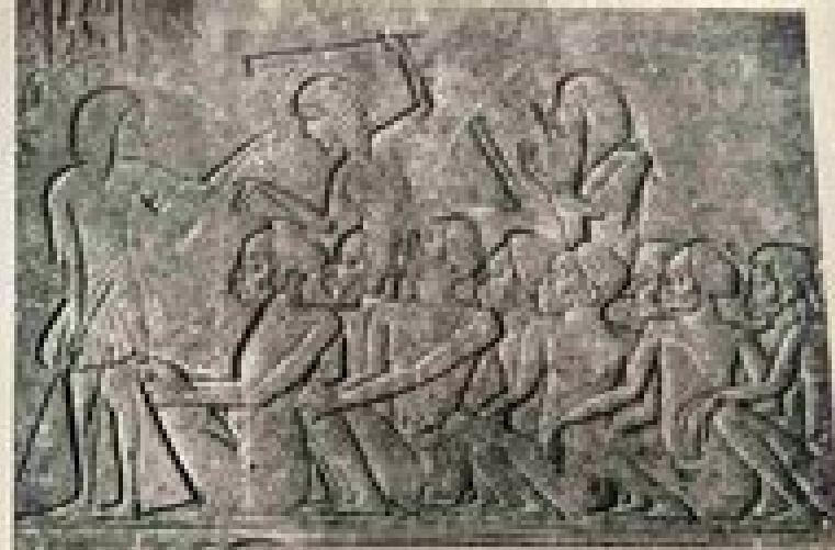
1. Slave market