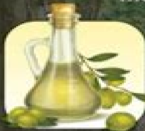
Olives & Olive Oil

The Bible identifies many foods that are beneficial to good health and longevity. This is important because your diet can have a profound impact on your physical, mental, emotional and spiritual well being.