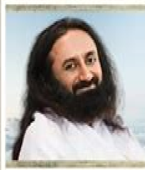
Sri Sri Ravi Shankar