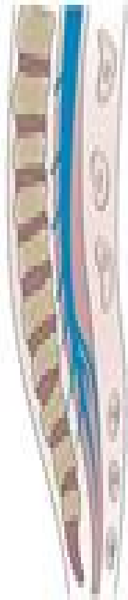
Spina bifida occulta

Closed asymptomatic NTD in which some of the vertebrae are not completely closed