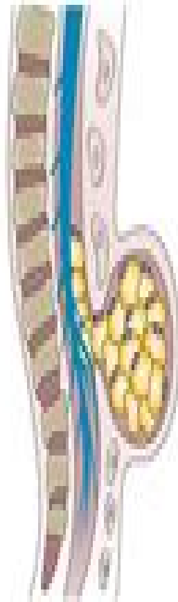
Closed spinal dysraphism

Closed asymptomatic NTD in which some of the vertebrae are not completely closed