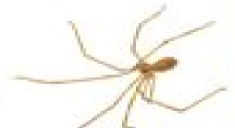
Long Bodied Cellar Spider