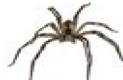
Common Rain Spider