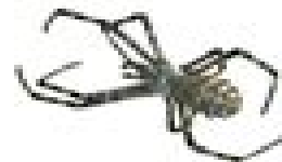
Lobed Argiope Spider