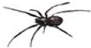
Black Cobweb Spider