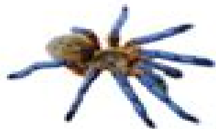
Golden Blue-legged Baboon Spider