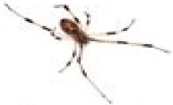
Brown Button Spider