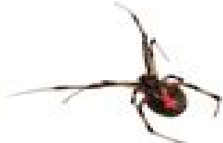
Brown Widow Spider