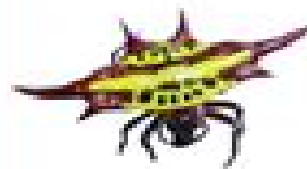
Long-winged Kite Spider