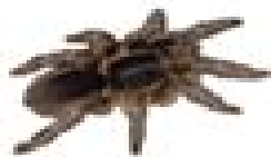
Common Baboon Spider