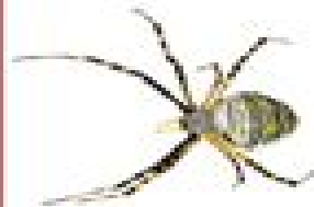
Banded Garden Spider