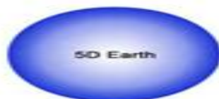
Magnetic Repulsion Zone