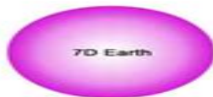
Magnetic Repulsion Zone