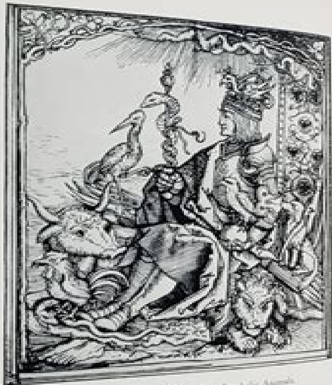
1. Maximilian surrounded by Symbolic Animals.