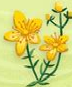
St. John's wort