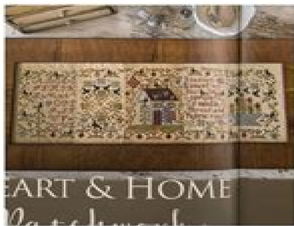
HEART & HOME Patchwork