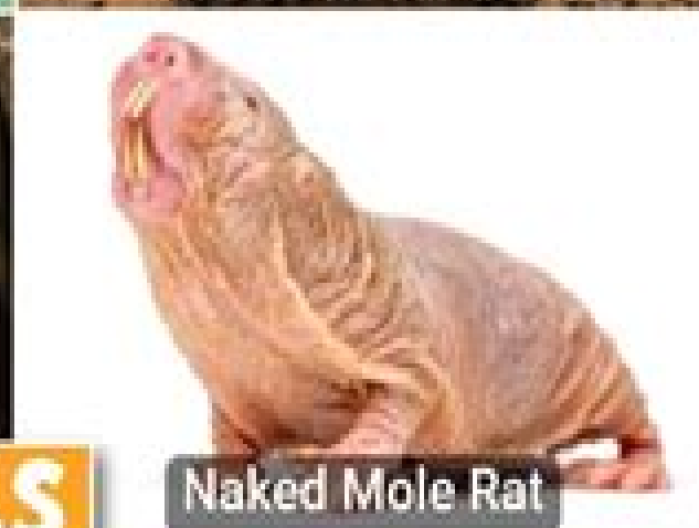
Naked Mole Rat