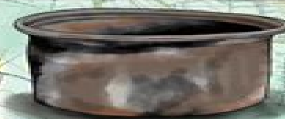
Malvernian jar . 1220-1500