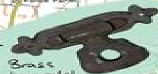
Brass bon catch 1900-1970