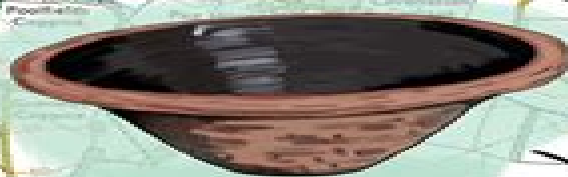
Earthenware pancheon 1700-1800