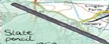
Slate pencil 1700-1950