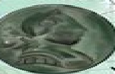
Counterfeit George III halfpenny 1770-1806