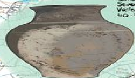
Roman Severn Valley ware 40-500