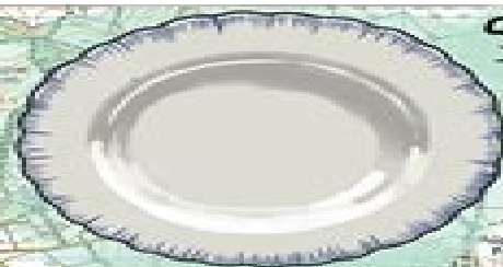
Pearlware plate 1780-1830