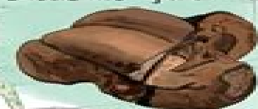
Butchery waste Cattle astragalus