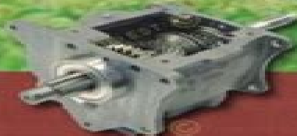
Boîte de vitesses T84H renforcée