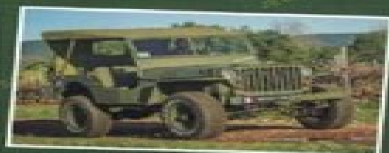
Jeep Hotchkiss M201 de 1956

Mécanique : Restauration d'une remorque Bantam (2 ème et dernière partie)