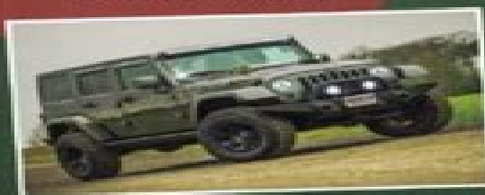
Jeep Wrangler JK 3,6 L V6 Unlimited 285 ch