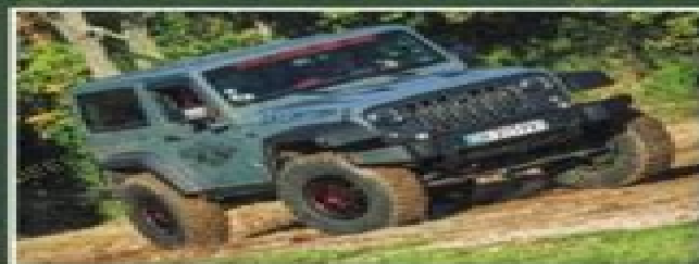
Jeep Wrangler JK 3,6 L V6 Rubicon 285 ch