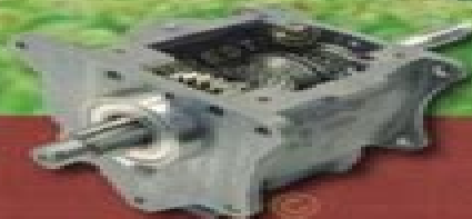
Boîte de vitesses T84H renforcée

White Scout Car M 3A1 • Housse d'arceau de Jeep personnalisée