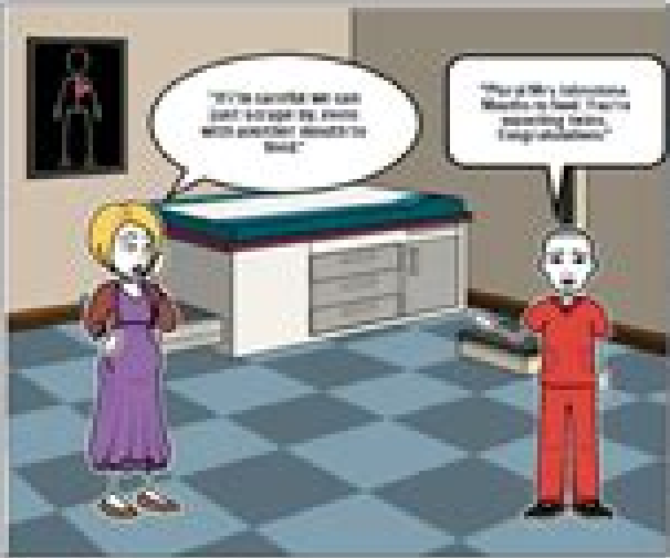
With another 2 on the way, she's worried as to what she will do, and how she might manage a family as big as hers.