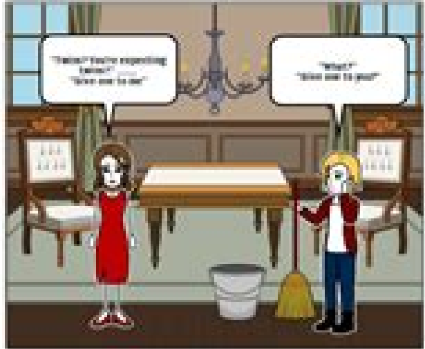
One day, while working for her employer Mrs. Lyons, Mrs. Johnstone and Mrs. Lyons have an interesting conversation. Mrs. Lyons reveals that due to not being able to have kids, but badly wanting some, she can ask Mrs. Johnstone for one of her babies, as she was under the impression that it would benefit both parties. By taking the child off of Mrs. Johnstone, and giving Mrs. Lyons what she desperately wants. Although, it all happens in a heartbeat, and some may argue, quite manipulatively.