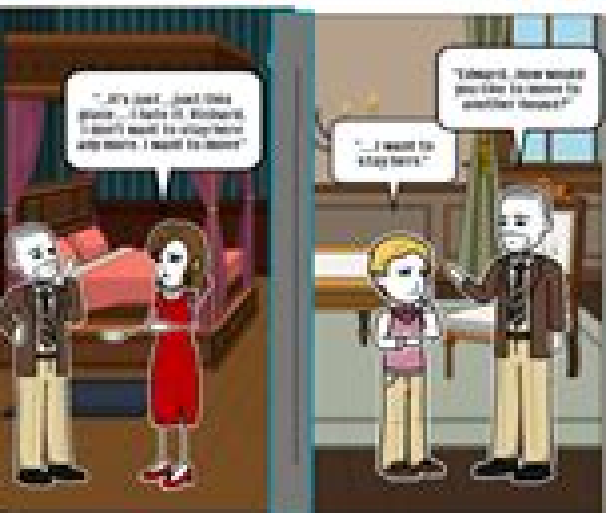
Due to this, Mrs. Lyons expressed her concerns ambiguously about Edward, and proposed the idea of moving houses to try and stop Edward from being in contact with the Johnstones and, eventually, it ended up happening, although Edward wasn't happy about it.