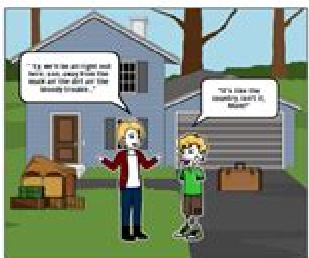
After Edward said his goodbyes, Mickey was left feeling sad, and especially lonely. In his luck though, Mrs. Johnstone found a new job, almost exactly where the Lyons' family moved to. The countryside.