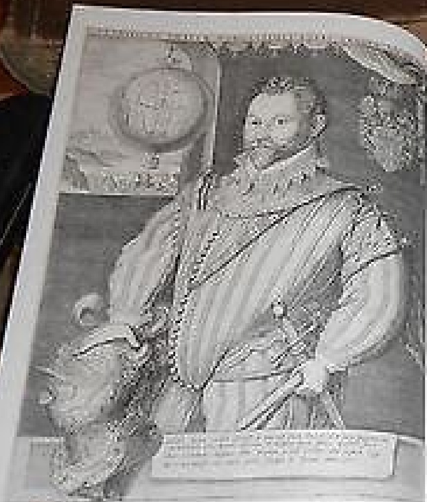
This portrait of Sir Francis Drake is based on a portrait by Hans Eworth, which was engraved in 1592. The portrait is now in the collection of the National Portrait Gallery, London.

WITH AN INTRODUCTION BY THE CURATOR OF THE NATIONAL PORTRAIT GALLERY AND A COMMENTARY BY THE CURATOR OF THE NATIONAL ARCHIVES