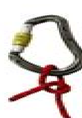
HALF HITCH KNOT