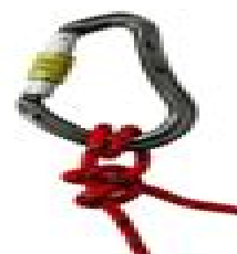
ROUND TURN AND TWO HALF HITCHES KNOT