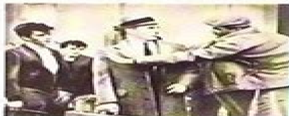
PUNKS GRABBING FOR BIG POWER