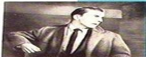
BIG SHOT IN A BIG SQUEEZE

Here come the people raging... the passions blazing out of the decade's wrathful best-seller!