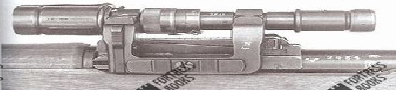
Abb. 1.27 Mauser: Karabiner und weitere Seitenansicht eines Gewehr 98k. Der Karabiner trägt das Gewehr - kurz - Gewehr 98k. Die Gewehr 98k ist ein Mauser Gewehr 98, das mit einem Kollimatorvisier ausgestattet ist und eine Kollimatorvisier hat. [1]