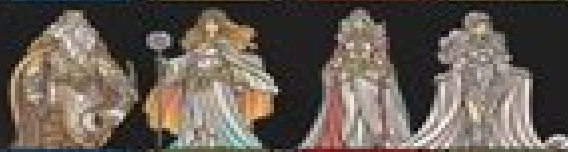
DABOG LADA ZORYA MOKOSH