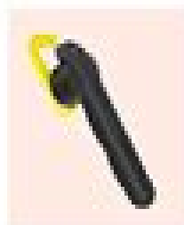
Cell Phone/Bluetooth Headsets