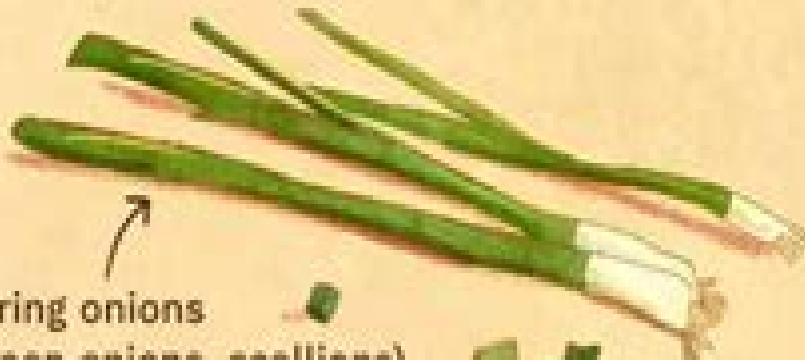
Spring onions (green onions, scallions)