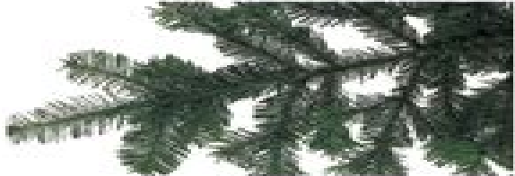
Noble fir Abies procera syn. A. nobilis