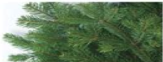
White fir Abies concolor