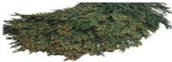
Incense cedar California incense cedar Calocedrus decurrens