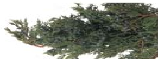
Juniper Juniperus communis