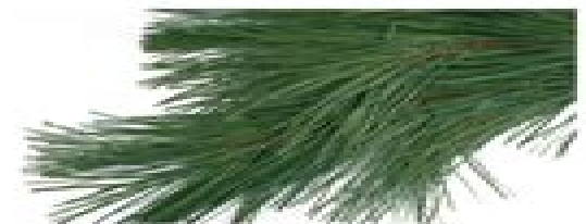
Ponderosa pine Western yellow pine Pinus ponderosa