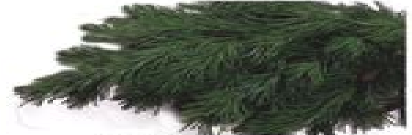
Shore pine / Beach pine Lodgepole pine Pinus contorta