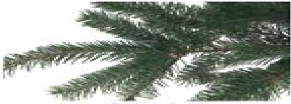
Douglas fir Pseudotsuga menziesii