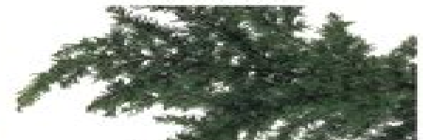
Mountain hemlock Tsuga mertensiana

(NOTE: Coniferous hemlock is not related to the poisonous herb Conium, which is also commonly known as hemlock.)