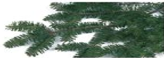
Balsam fir Abies balsamea