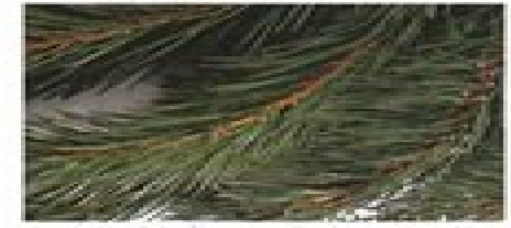
Scots pine Scotch pine / Scotch fir Pinus sylvestris