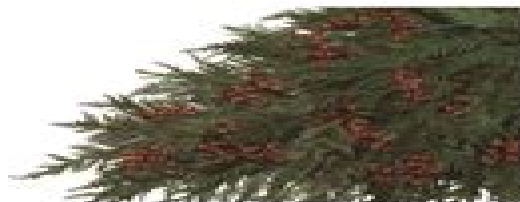
Coned cedar (Western red cedar) Thuja plicata