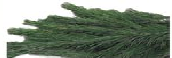
White pine Weymouth pine / Princess pine Pinus strobus