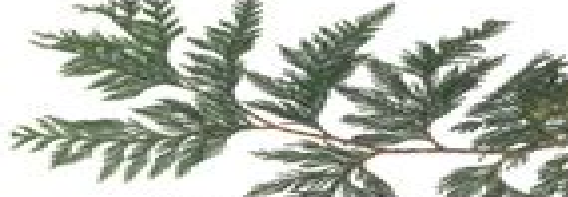
Western red cedar Thuja plicata