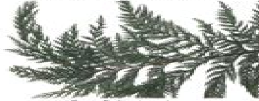
Port Orford cedar Lawson cypress Chamaecyparis lawsoniana