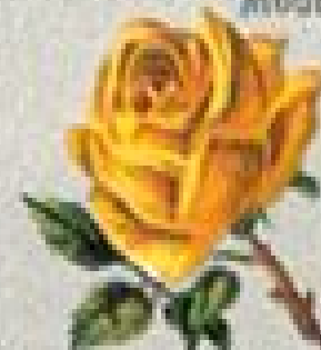
Yellow Rose Contentment