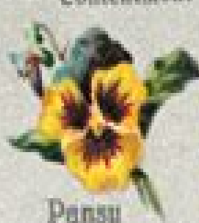
Pansy Messenger of love