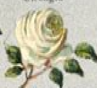
White rose Purity