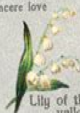
Lily of the valley Sensitiveness