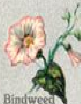
Bindweed Tender love