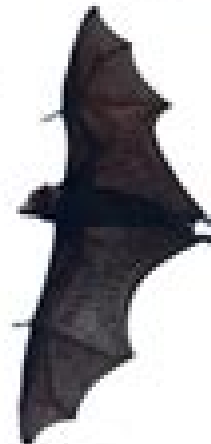
Black Flying Fox