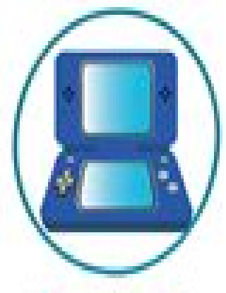
Handheld gaming device