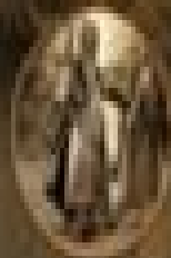
Thomas à Kempis