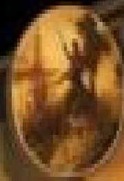
Thomas à Kempis