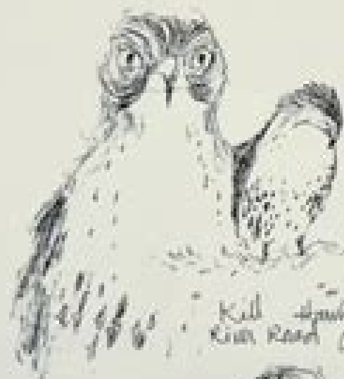
Kill Hawk near SEA River Road, Chesham