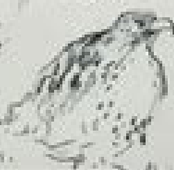
The hawk stayed by the hill. Stopped to take pictures and she called out. This hawk later she was still there.