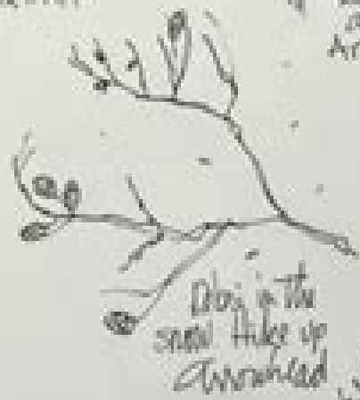
Down in the snow. Hike up Arrowhead