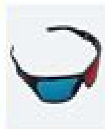
Video Glasses & eyewear