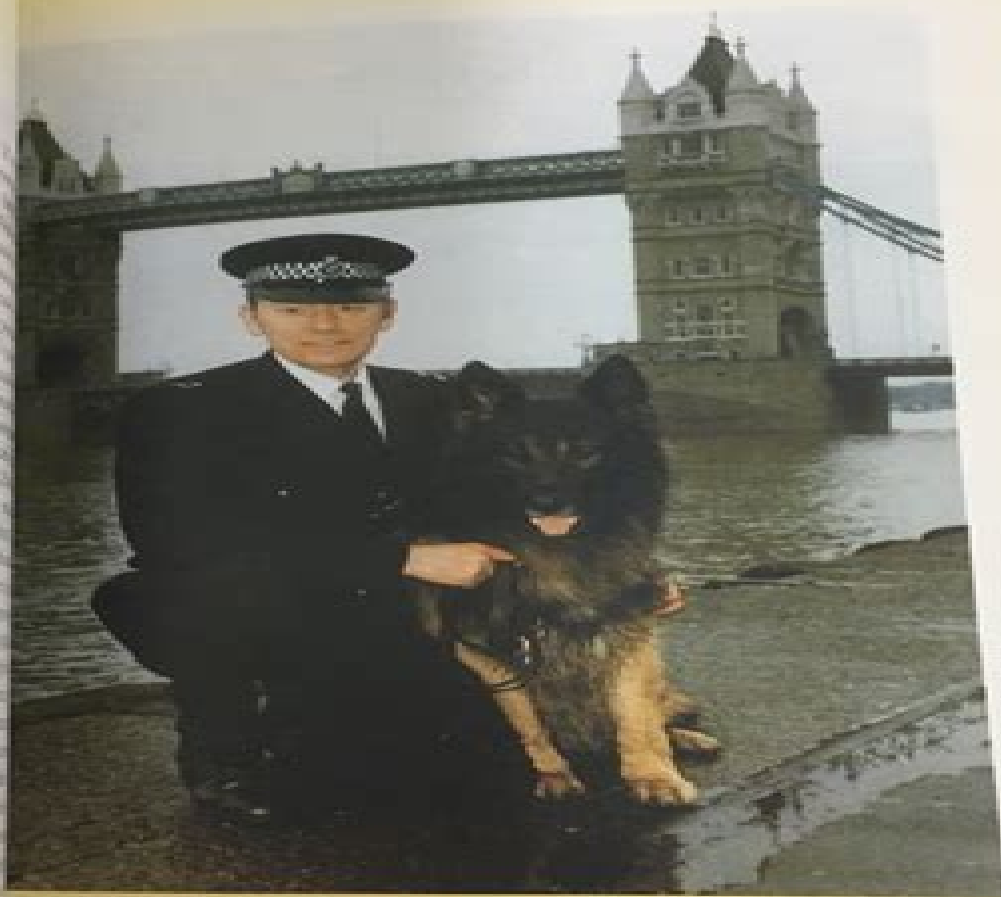
Niemiecki służy w policji na całym świecie.