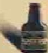
IRISH ALE + Germany