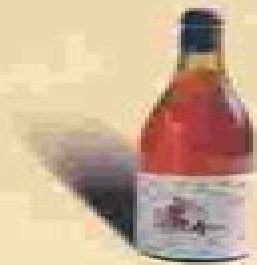
FRAMROSE + Germany