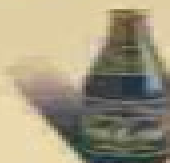
MUNICH-STYLE + Germany