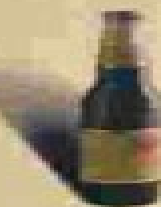
CHRISTMAS BEER + Germany