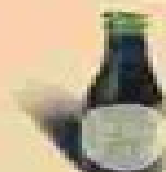
BARLEY WINE + Germany