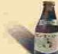
TRAPPIST ALE + Germany