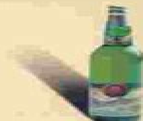
ORIGINAL PILSENER + Germany