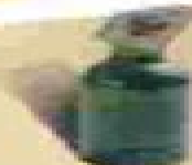
VIENNA-STYLE + Austria