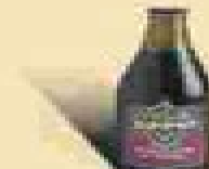
PORTER + Germany