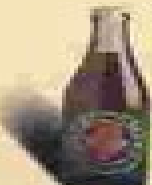
WHEAT BEER + Germany