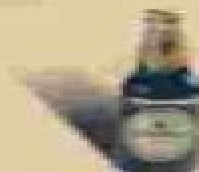
PILSNER + Germany