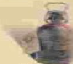
DOUBLE ROCK + Germany