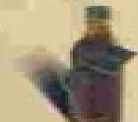
AMBER ALE + Germany