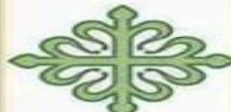
ALCANTARA EST. 1177