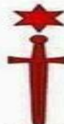
DOBRYN EST. 1216