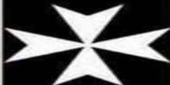
KNIGHTS HOSPITALER EST. 1099