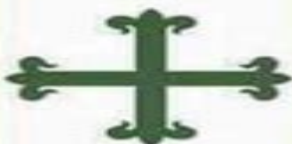
AVIZ EST. 1128