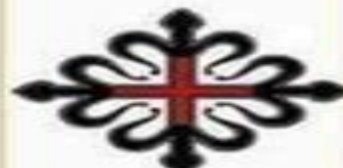
MONTESA EST. 1317