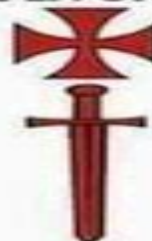
BROTHERS OF THE SWORD EST. 1202