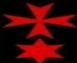
CRUSADERS OF THE RED STAR EST. 1223