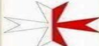
MOUNTJOY EST. 1180