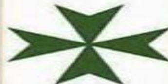
SAINT LAZARUS EST. 1123