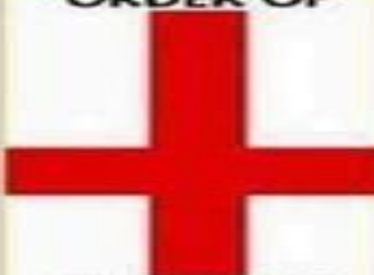
SAINT GEORGE OF AFALMA EST. 1201