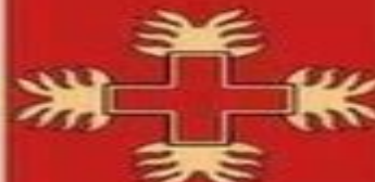
THE DRAGON EST. 1408