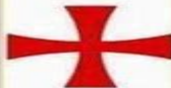
KNIGHTS TEMPLAR EST. 1119