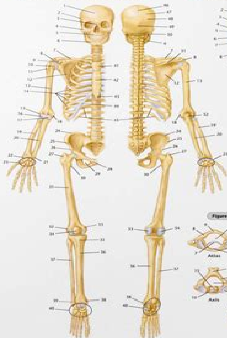
Figure 1: Full Skeleton (Anterior & Posterior Views)