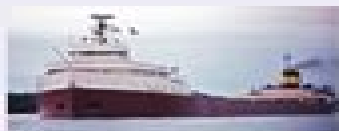
S.S. Edmund Fitzgerald (1958)