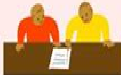
4. Following directions