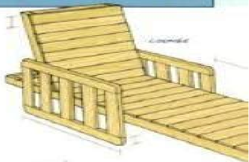
ARBORETUM-TYPE TRELLIS (BENCH)