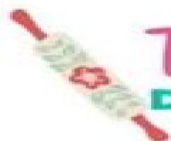
Tableau de conversion DES MESURES & TEMPÉRATURES