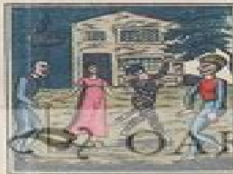
Repetition of the Old Appearance of each other.