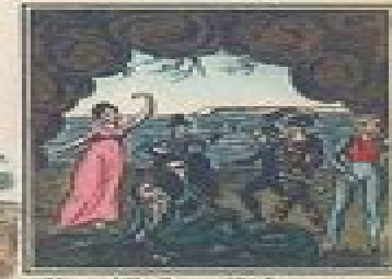
Mother Goose, with the recovery of the Egg.

LONDON THURSDAY 6TH AND FRIDAY 7TH JUNE 1991