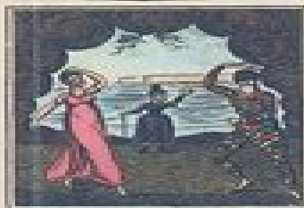
Mother Goose passing the Egg into the Sea.