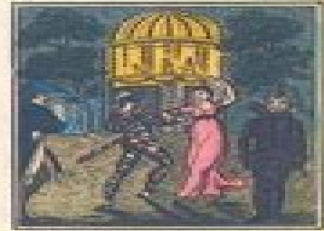
Interior of Vauxhall.