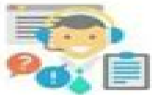
Sales & Marketing