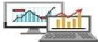
Stock Market Investing