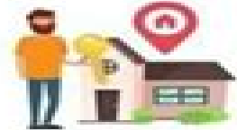
Real Estate Investing