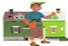
Basic House Maintenance