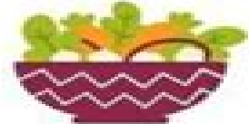
Diet & Nutrition