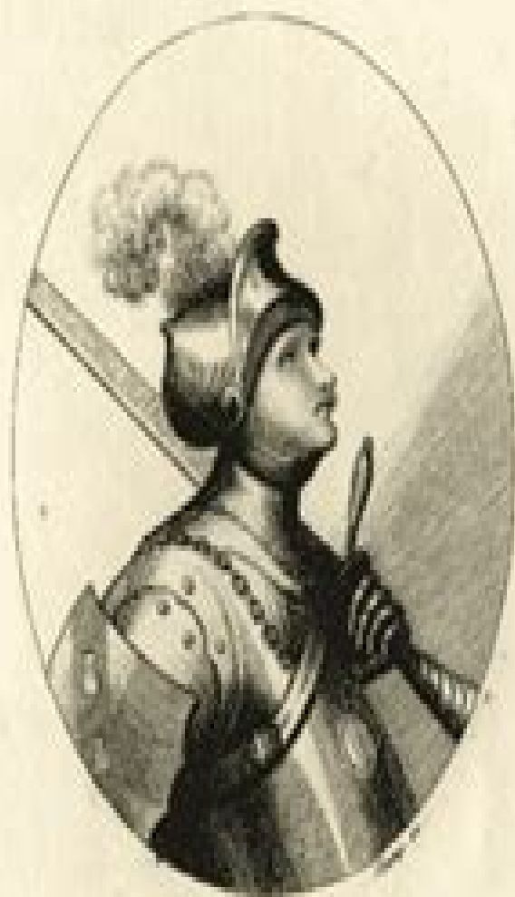
St. John Tostolfe

From the Oxford Almanack for the Year 1730.