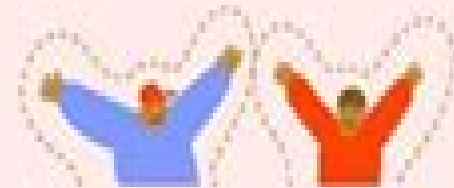
5. Respecting personal space