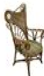
Art Nouveau Furniture 1890-1914AD