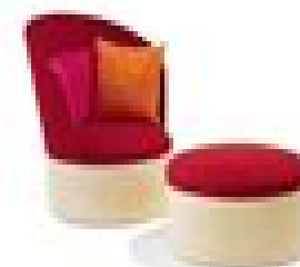
Contemporary Furniture 1980-Present