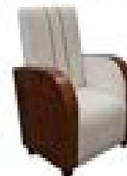
Art Deco Furniture 1925-1940AD