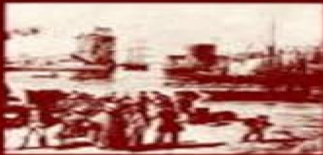
Illustration by [illegible]