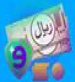
Protection & Saving Insurance