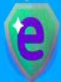
Other Types of Insurance