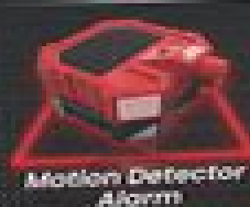
Motion Detector Alarm