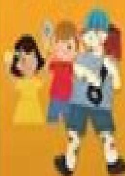
Illustration by [unintelligible]