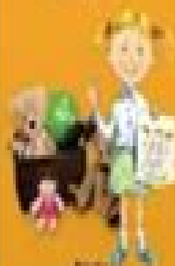
Illustration by [unintelligible]