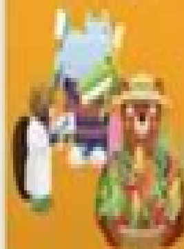
Illustration by [unintelligible]