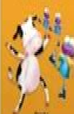
Illustration by [unintelligible]