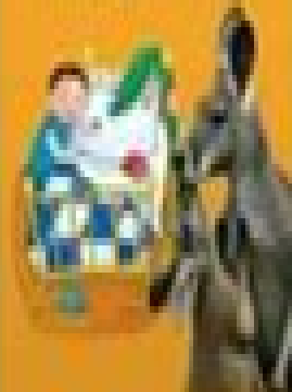
Illustration by [unintelligible]