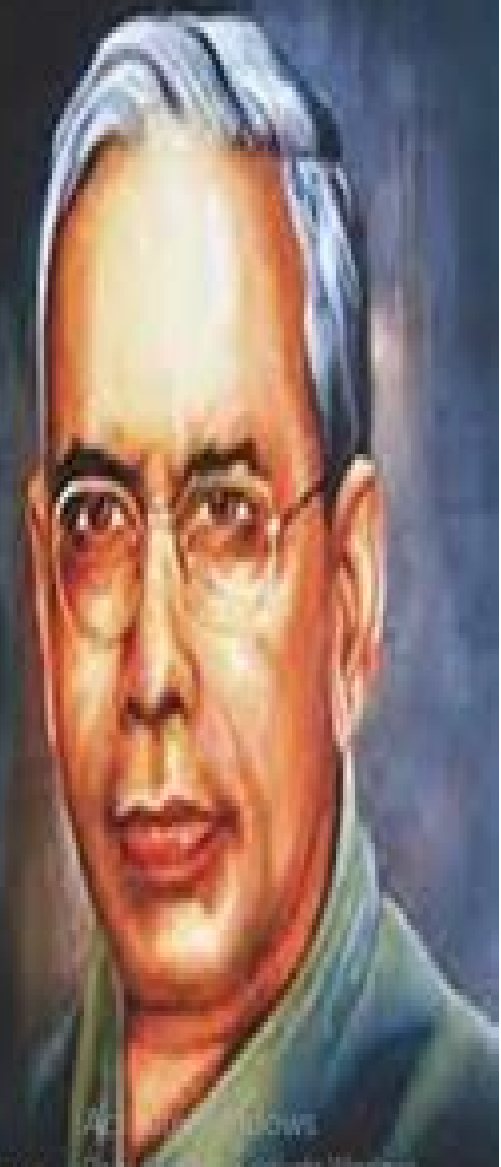
Padmashree Dr. S. R. Ranganathan 12/9/1892 - 27/9/1972