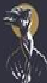
ARTEMIS / DIANA