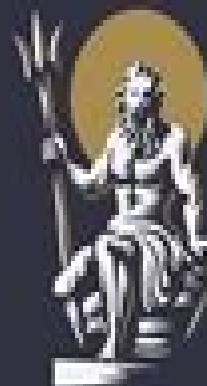
POSEIDON / NEPTUNE