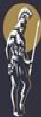
ARES / MARS