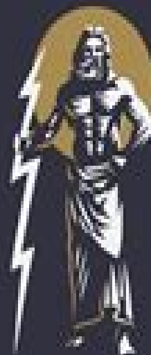
ZEUS / JUPITER