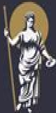
HERA / JUNO