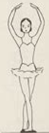
Fifth position en haut of the arms (with the feet in the fifth position).