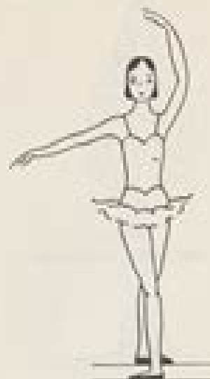
Fourth position en haut of the arms (with the feet in the fourth position croisé).