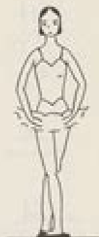
Fifth position en bas of the arms (with the feet in the fifth position).