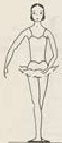
Third position of the arms (and feet).