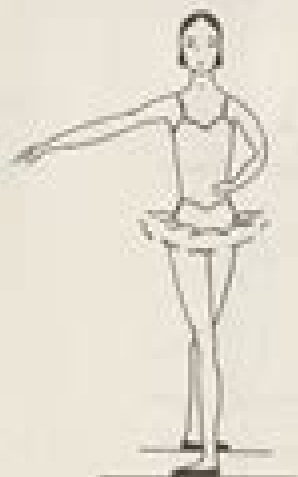
Fourth position en avant of the arms (with the feet in the fourth position croisé).