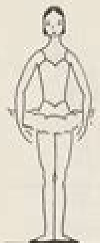
First position of the arms (and feet).